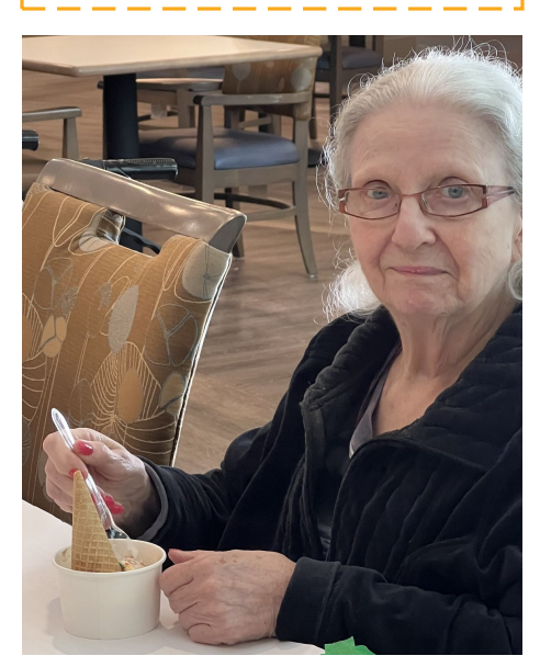
It was the sweetest treat creating our own sundaes with toppings that we love!

On Wednesday, September 20th, we will be decorating purple rocks for our future display that will be presented at The Lodge at Glen Cove's table at the Walk to End Alzheimer's event later this year in Suisun!