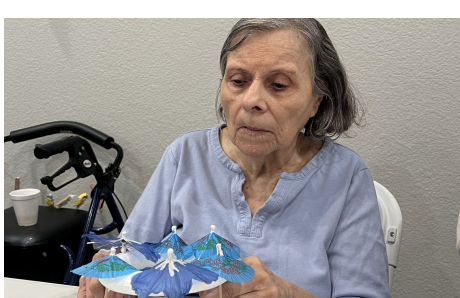
Residents make Summer Wreaths during a Cafe Craft!