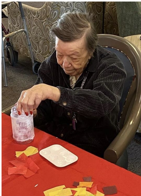
Memory Care had such a fun time making our Fall Mason Jar Luminaries with Assisted and Independent Living! We look forward to more combo activities!