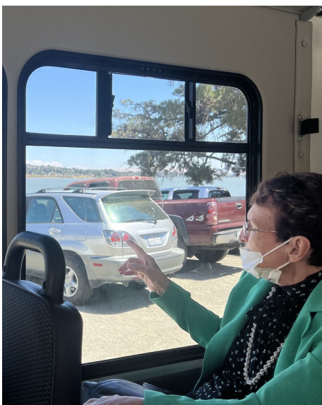
It's so nice to get to explore on our weekly scenic drives!